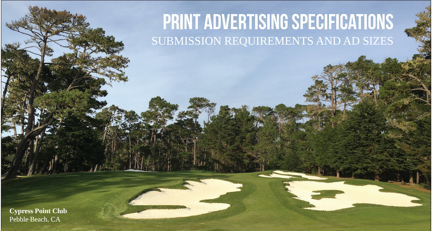
Cypress Point Club Pebble Beach, CA

Publication Size: 5.437" x 8.25" (Digest Size)